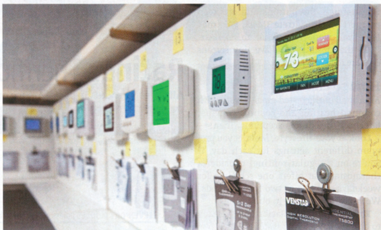
CLEAR FAVORITES Some thermostats were a snap to set, even without reading the manual.